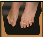
Flexible toe separators

Make sure nails are dry and free of lotion/oil. Place the enclosed flexible toe separators between the toes, and apply a layer of solution to the nails. Let dry for 3 to 5 minutes then reapply a second coat of the solution to be sure the nail surface and the edges of the skin are covered.